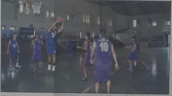
The Don Bosco College of Engineering cagers in action against Goa College of Architecture, Altinho, at DBO indoor stadium, Panaji, on Friday

In the boys section, BITS-Pilani, Zuarinagar, romped to victory over Don Bosco College, Panaji, 58-31. Don Bosco College of Engineering, Fatorda, defeated Goa College of Architecture, Altinho, 66-20.