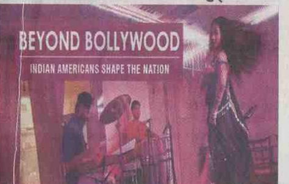
वियाँण्ड बॉलिव्ड प्रदर्शनातील चित्रकृती.

बिट्स पिलानीच्या परिसरात भरणार आजपासून प्रदर्शन